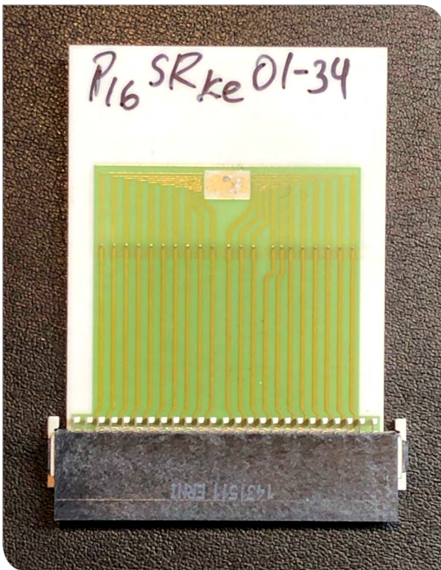
Sensor chip with 16 subsensors

The presently available e-nose is based on the KIT-developed KAMINA (Karlsruhe Micro Nose). The functioning principle, components, and setup of the latest version were optimized considerably to achieve an inexpensive product. This product is designed for the industrial and private mass market. Wherever expensive instruments are encountered for precise chemical analysis of gas components, the e-nose is to offer a quick and easily useable solution. It will supply the essential information as to whether an odor is harmless or what type of odor it is. For more precise analyses, the system may be combined with other sensors.